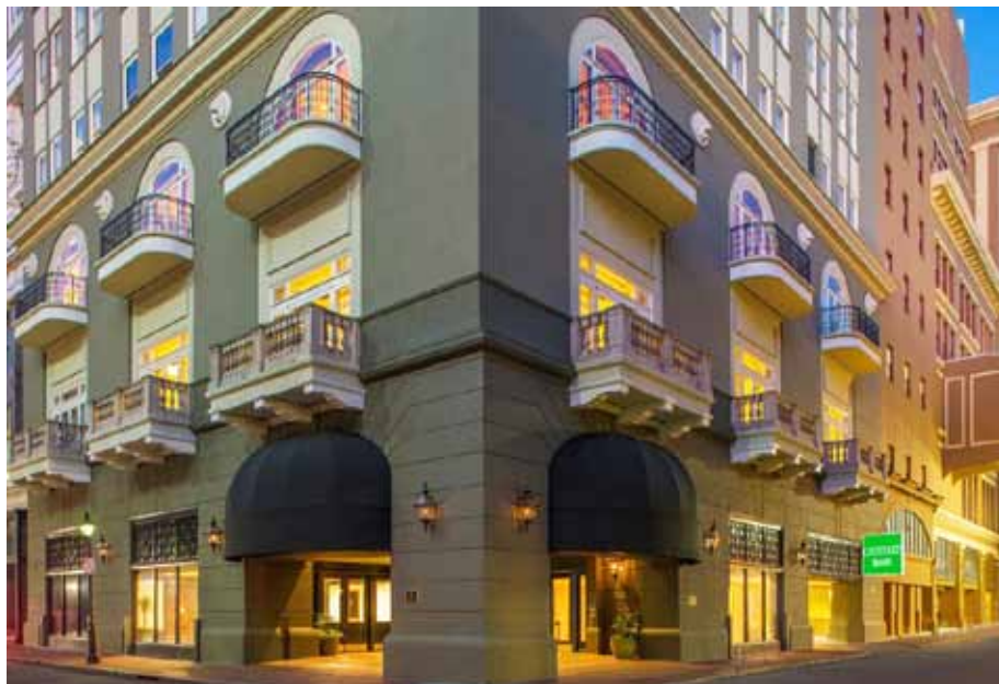
Elegant building of the Marriott Courtyard Iberville situated in the French Quartier of New Orleans

Attendees of the SHD Meeting in New Orleans will have the opportunity to enjoy a guided tour to the Williams Research Centre's rich collections, which include 35,000 library items and more than 300,000 prints, maps, drawings,