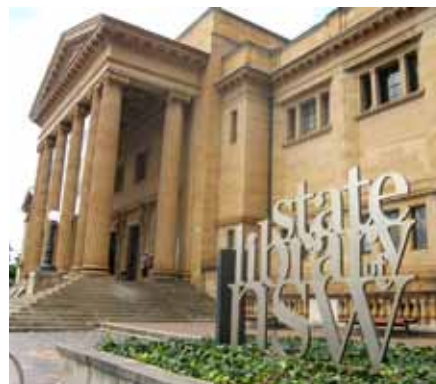
State Library of New South Wales

2020 is an important year as SHD celebrates its 60th anniversary and as it is also the 250th anniversary of James Cook's discovery of the east coast of Australia. To mark this occasion, SHD will be co-sponsoring a conference in honor of the 250th anniversary on September 7-9, 2020 at the State Library of New South Wales in Sydney, Australia. SHD will take an active part in this event as its supporter and partner (along with IMCoS). The conference and planned optional technical and social excursion are open to cartographers, geographers, historians, map collectors, academics and everyone with an interest in maps and the diverse aspects of the history of discoveries. There will be an