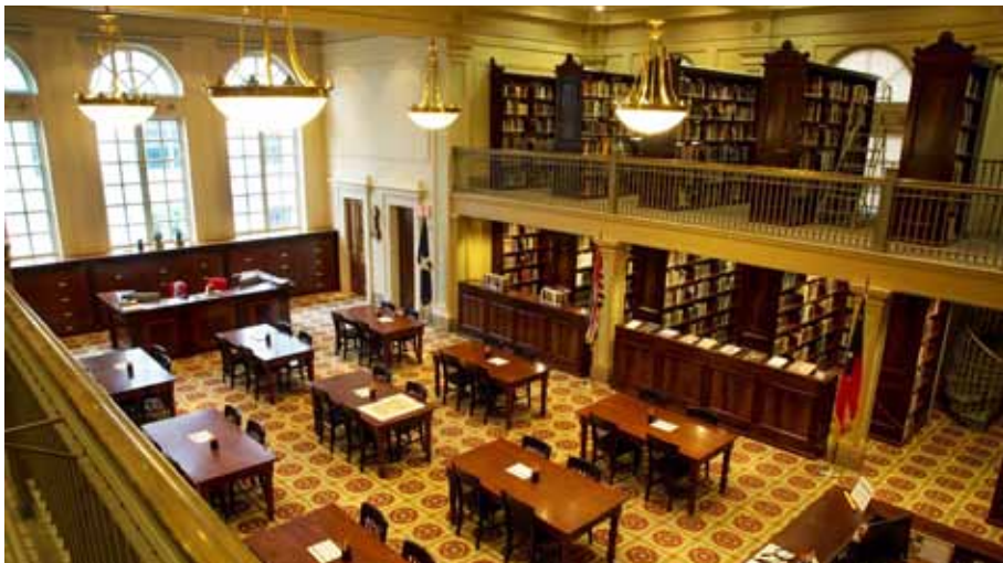
View of the Williams Research Center reading room from the upper gallery

The 2020 SHD Annual Meeting will be hosted by the Williams Research Center, which is part of The Historic New Orleans Collection (THNOC). Consisting of the museum, research center, and publisher dedicated to preserving the history and culture of New Orleans and the Gulf South, the Historic New Orleans Collection,