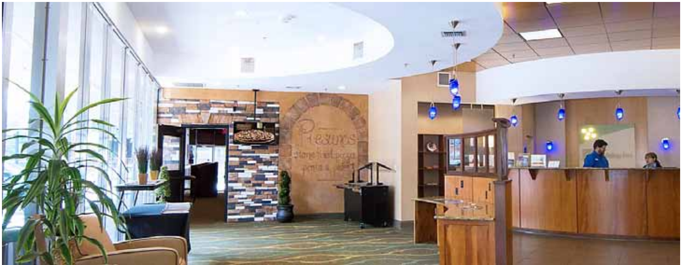
Holiday Inn, Gainesville