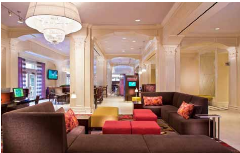
Lobby of the Marriott Courtyard Iberville, New Orleans

paintings and manuscripts pertaining to Louisianan history. Besides the Williams Research Centre treasures, attendees will be provided with a unique opportunity to visit a large exhibition on New Orleans and the Spanish World opening on October 20, 2020, which will include a good number of maps from Spain, especially military archives. The hotel accommodation will be provided by Marriott Courtyard Iberville, situated in the very heart of the French Quartier and only a 10 minute walk from the conference venue.