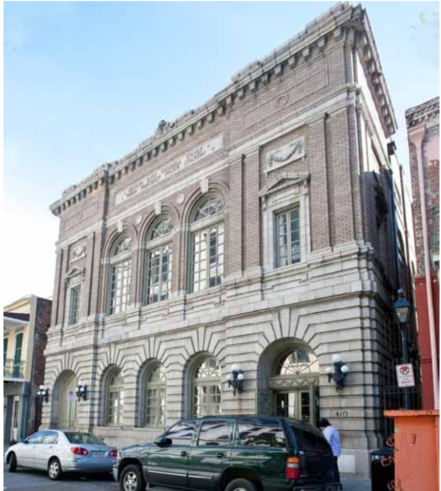
Above photo: Built in 1915 in the Beaux Arts style, this two-story brick structure housing the Williams Research Center WRC since 1993 (previously the Second City Criminal Court and the Third District Police Station)

All of 2020 will be marked by the celebration of our anniversary, which will be honoured through several events. In addition to supporting some of the major international events related to the history of discoveries, like James Cook 250th anniversary conference in Sidney (September 7-9, 2019), the central celebration of the SHD anniversary will be held at our 2020 Annual Meeting that takes place in New Orleans, November 13-15.